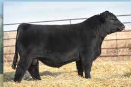
TKCC ESCALADE 1820E