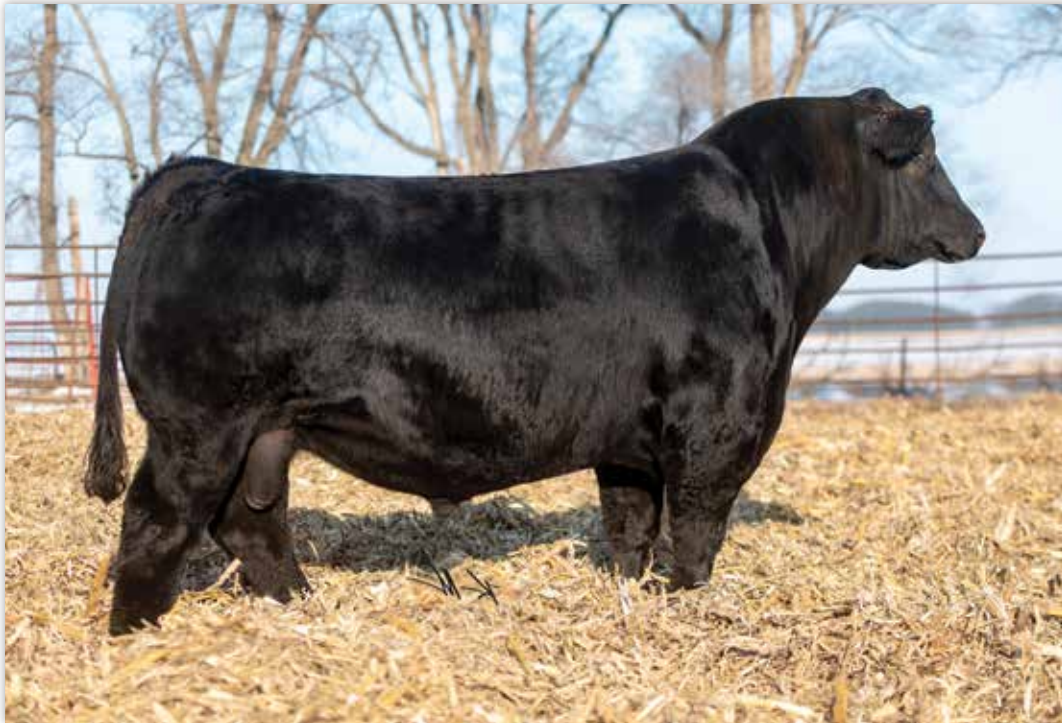
W/C DOUBLE DOWN 5014E - SIRE OF LOT 75 - 79

The W/C Double Down sire group is one that was sampled heavily in the past couple years. We feel that his reputation for unassisted, low birth weight stock with suitable post birth growth and performance will only increase his use in the years to come. Double Down sired the Reserve National Champion Bull in the recent Cattlemen's Congress held in Oklahoma City that was exhibited by JS Simmentals of Iowa with the bull they call Double Up. As this young sire gets introduced to more of the breed's finest, there's no question that you will be seeing more of these calves by Double Down. This sire group, like the Dakota's, are all out of two year old females and were unassisted at calving time.