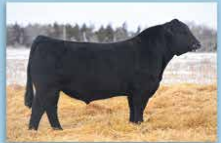
TKCC CARVER 65C