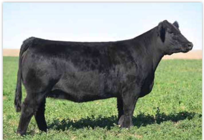
TKCC VICTORIA 57A - MATERNAL GRANDDAM OF LOT 76

One of the class act performers of this sire series would be this one from a High Calibre x Victoria bred dam. His dam's flush was quite impressive in the replacement and bred pens, some of the absolute best females ever made on the ranch, undisputedly. We believe that you will like this one's substance and build for your program.