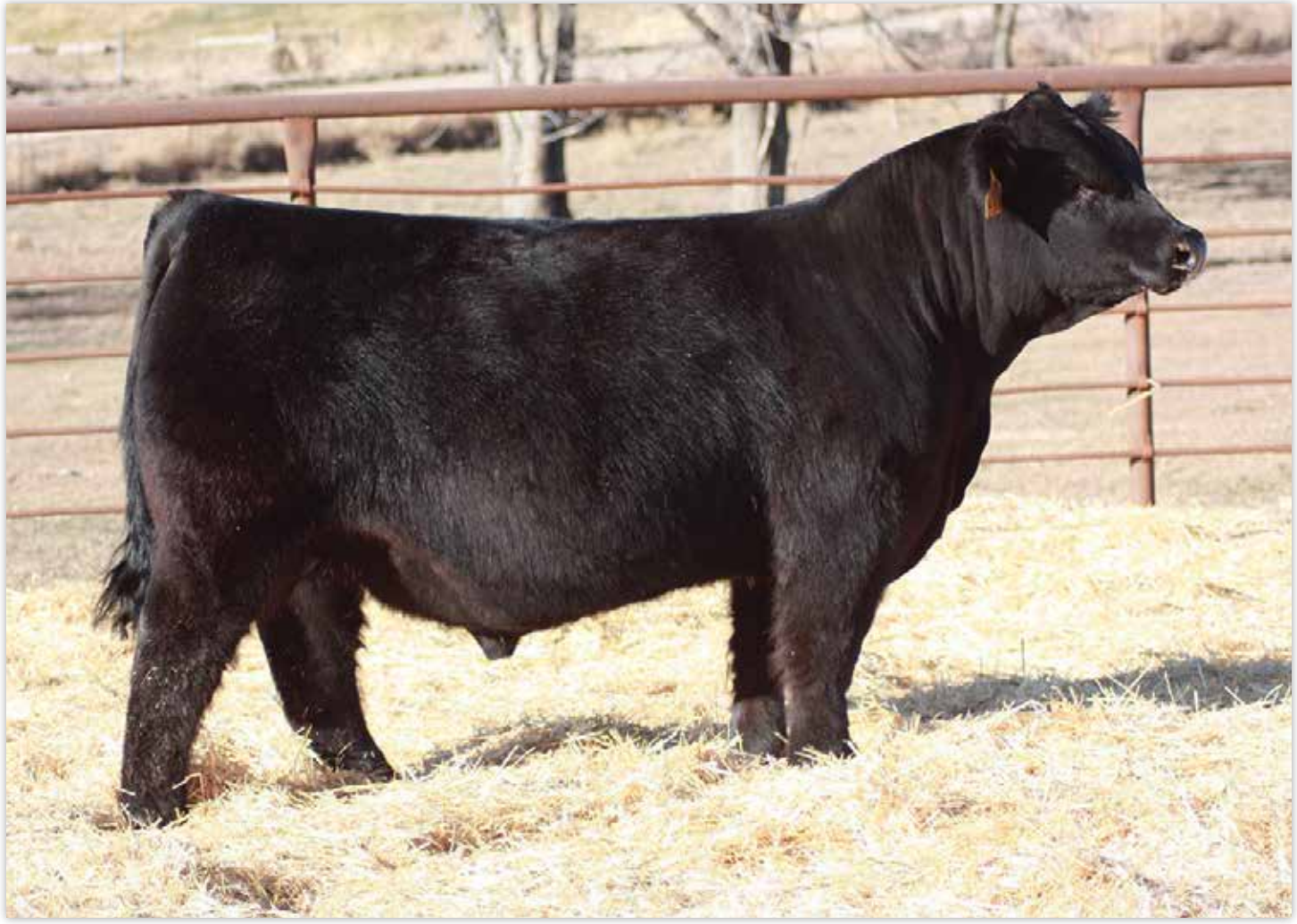
W/C SON OF A BISCUIT 83E - SIRE OF LOTS 33 - 35