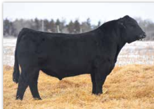
TKCC CARVER 65C SIRE OF LOTS 13 & 14

538H and 366H would be the full brothers to the Krebs Ranch purchase, Empire. This mating is proven and have proven to be flawless and profitable, not only for Kearns but for the ranchers that have invested in this cross in the past. This mating is met with proven unassisted calving, mostly solid black calves with vigor and post birth growth and performance. These studs have the profile and pattern stamped by their dam with the ultimate shape and power from their sire when one gets the multi-dimensional view of each. Predictable and Profit positive seedstock available for your appraisal.