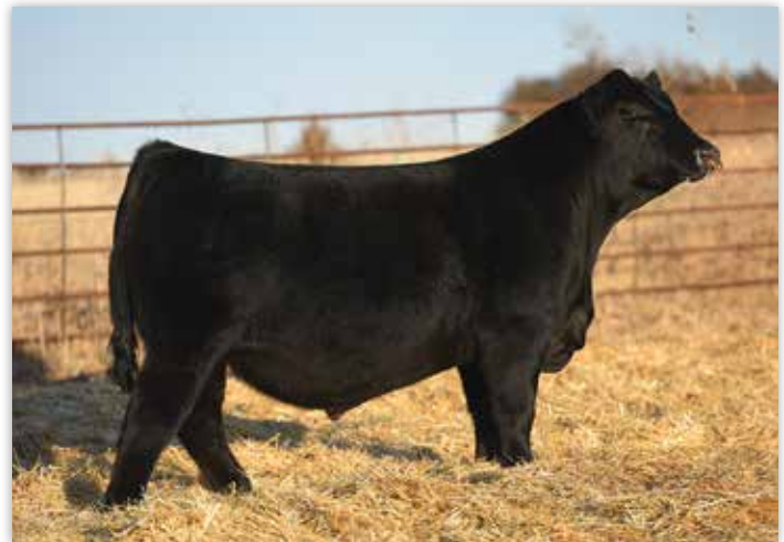
KCC1 EXECUTE 109E - SIRE OF LOT 65

A smooth made SimAngus suggested heifer bull by Empire's full brother Execute from a proven daughter of Broker and the foundation, 1780.