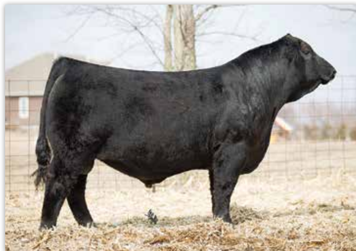
OVAL F ECHO E709 - SIRE OF LOT 25

The Echo sire group is one that you will see a lot of in the Ruby Cattle Co. program of south central Iowa. We sampled him with success here in Rushville as evident by Lot 25. 65H is loaded up with natural base width and dimension. He's big and bold in his rib and hits the ground on a text book foot with definite agility when in motion. This calf is the loose built kind that will get cows bred and sire a set of calves with true real world merit.