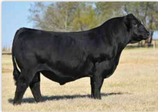
ES RIGHT TIME FA110-4 - SIRE - SIRE OF LOT 1 & 2