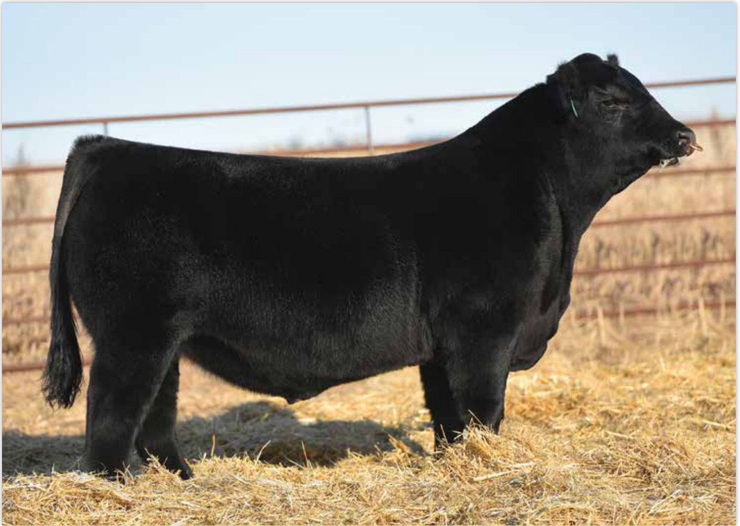
KCC1 EMPIRE 280E - SIRE OF LOTS 59 - 64