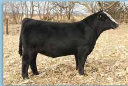
TKCC CANNON 77C