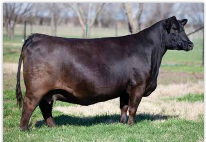
TR MS PRECISION 2077Z - DAM OF LOTS 6 - 14