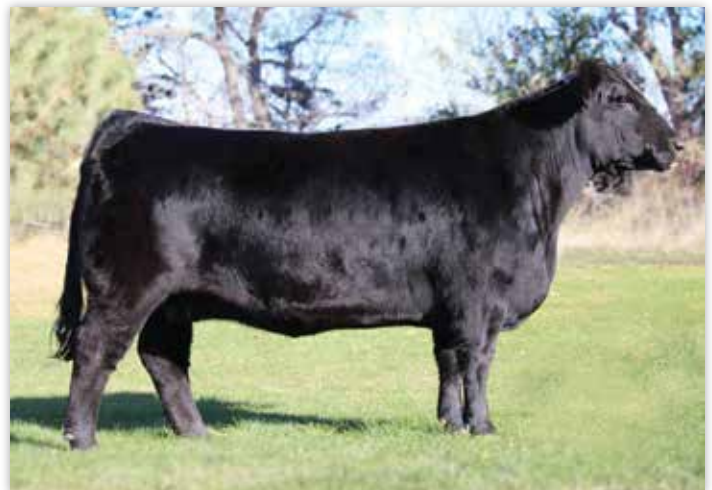
FORD RJ DOLLY Y83 - MATERNAL GRANDDAM OF LOT 75

From the proven blend of Pilgrim and Dolly hails this lead off son of Double Down. Significant look and build in this creature.