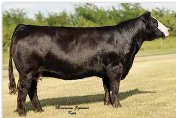
3C MELODY M668 BZ - LEGENDARY MATERNAL GRANDDAM OF LOTS 26 - 28