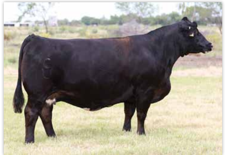
CCR MS MISTY MAY 8014U - DAM OF LOTS 15 - 25