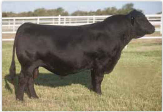
HOC DAKOTA 111D - SIRE OF LOTS 70 - 74

Lot 70 could be one of the best built, best looking sons ever of the proven 111D. His dam is a very impressive first calf female that is entering her second year of production. This bull's mother is a direct daughter of the udder king, High Calibre, with the Driver x Tiara blend on the bottom that has highlighted programs like Red River Farms, Hidden Oaks Cattle, and Circle M Farms with much success.