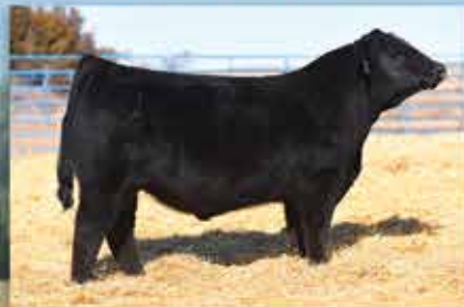
TKCC CERTIFIED 7C