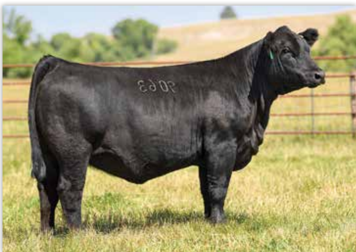
KCC1 MS EXCLUSIVE 90636 - MATERNAL SISTER TO LOTS 15-25

Lot 19 KCC1 BATTLECRY 384H REG: 3848505 DOB: 2/24/20 PB SM HOMOZYGOUS POLLED | HOMOZYGOUS BLACK