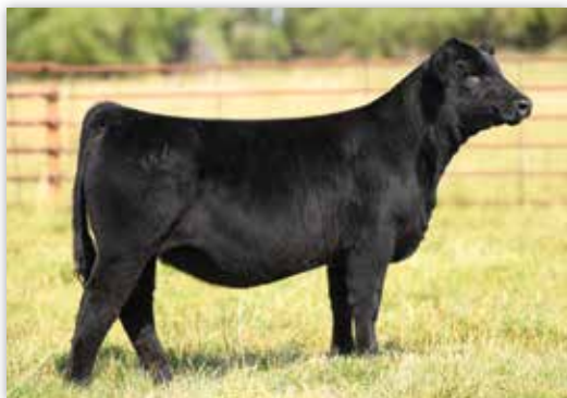
KCC1 SWC HARMONY 847H - $60,000 SISTER TO LOTS 1 & 2

3001H would be the brother born on the next ET cycle back, but he's hot on the heels of his slightly bigger brother. He is super long sided, big in his upper rib, back, and in his pin set. He is the blaze faced bull in the offering to enhance length and outline size in a set of calves and he will always be a direct son of Havana by Right Time.