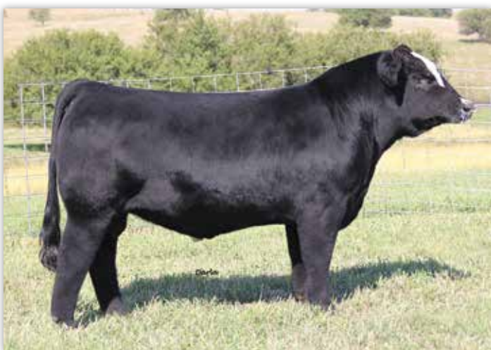
MR CCF VISION - SIRE OF LOT 36

This Profit sired duo from the legendary Dolly are long sided cattle with added weight and look. The opportunity presents itself on multiple occasions to acquire multiple full brother combinations and or maternal brother scenarios throughout this entire offering, so take advantage of this opportunity.