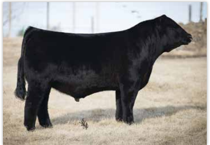
RUBY SWC BATTLE CRY 431B - SIRE OF LOTS 6 - 9