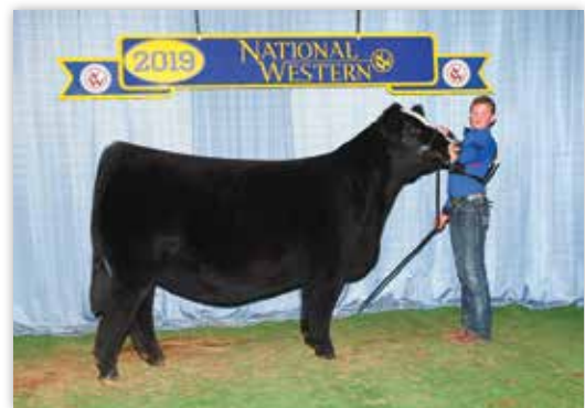
KCC1 HAVANA 83E - DAM OF LOTS 1 - 5

872H has always been a standout in the dense field of male contemporaries on the ranch since birth. We admire his foot size, bone dimension, power, shape and skeleton. What he offers from the shoulders back is challenging to replicate. If you're a breeder desiring a Right Time son from an elite cow or an aggressive commercial cattleman with her enhancement on the list of criteria, this one will be on many shortlists for sale day.