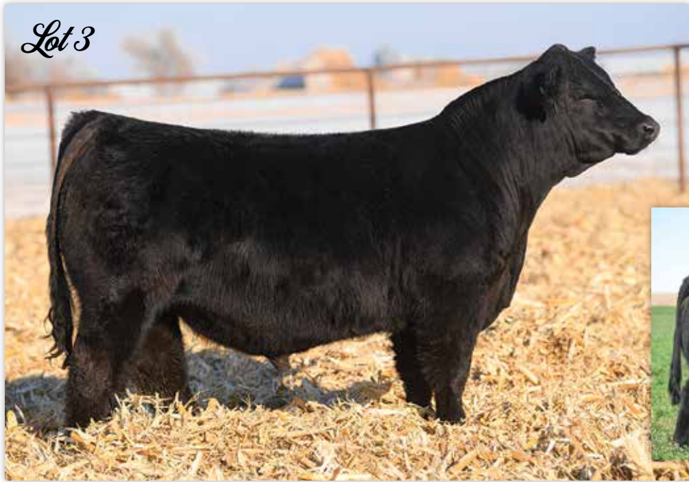
TKCC VICTORIA 57A MATERNAL GRANDDAM OF LOTS 1 - 5