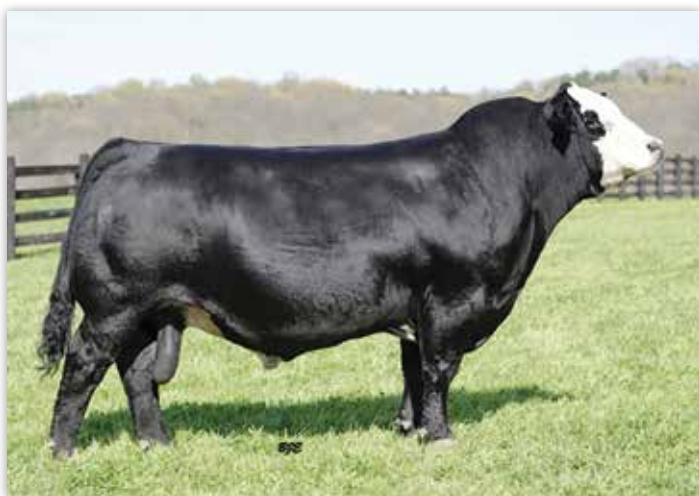
REMINGTON LOCK N LOAD 54U - MATERNAL GRANDSIRE OF LOT 50