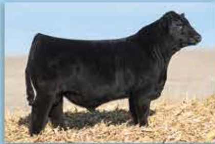
TKCC FROST 38F