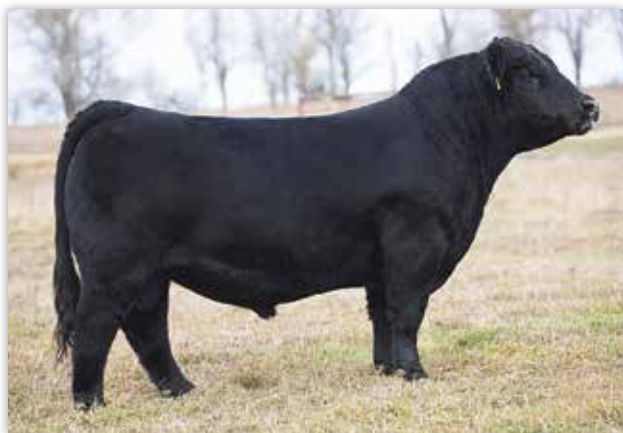
PROFIT - SIRE OF LOTS 3-5

This will be the second set of ET Profit sired calves from Havana and we are certain these are tremendous in terms of their look and power. We believe that this lot 3 stud is a breeder bull for those that want the Profit influence that's tied to a potent cow family. The Profit reputation is for the trademark look and length of the front one third. From his shoulder back we're not sure there is one that has any more width, dimension, and skeletal integrity. He is an athlete in motion with great body and base width, with a big back, stout hip/pin placement, with extra depth of quarter. He is the true "rancher bull" of the trio.